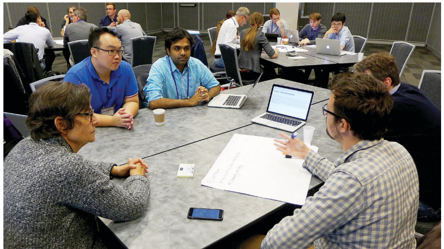
Discussing opportunities and challenges for cross-device interaction at the CHI 2016 workshop.

Designing for scale and interoperability. Because devices and their operating systems are still largely designed from the perspective of a single user interacting with a single device, interconnecting different or large numbers of devices tends to be complicated. Without certain pre-programmed behavior or a priori knowledge about all possible configurations, cross-device configurations of systems are simply not possible. This makes ad hoc federations of devices that have never before been connected very difficult. Moreover, users often want to combine devices for specific tasks and activities. Most current approaches expose users to infrastructure problems where they need to connect, pair, or install additional software to make devices work together. Sharing content across devices and people is simply not an